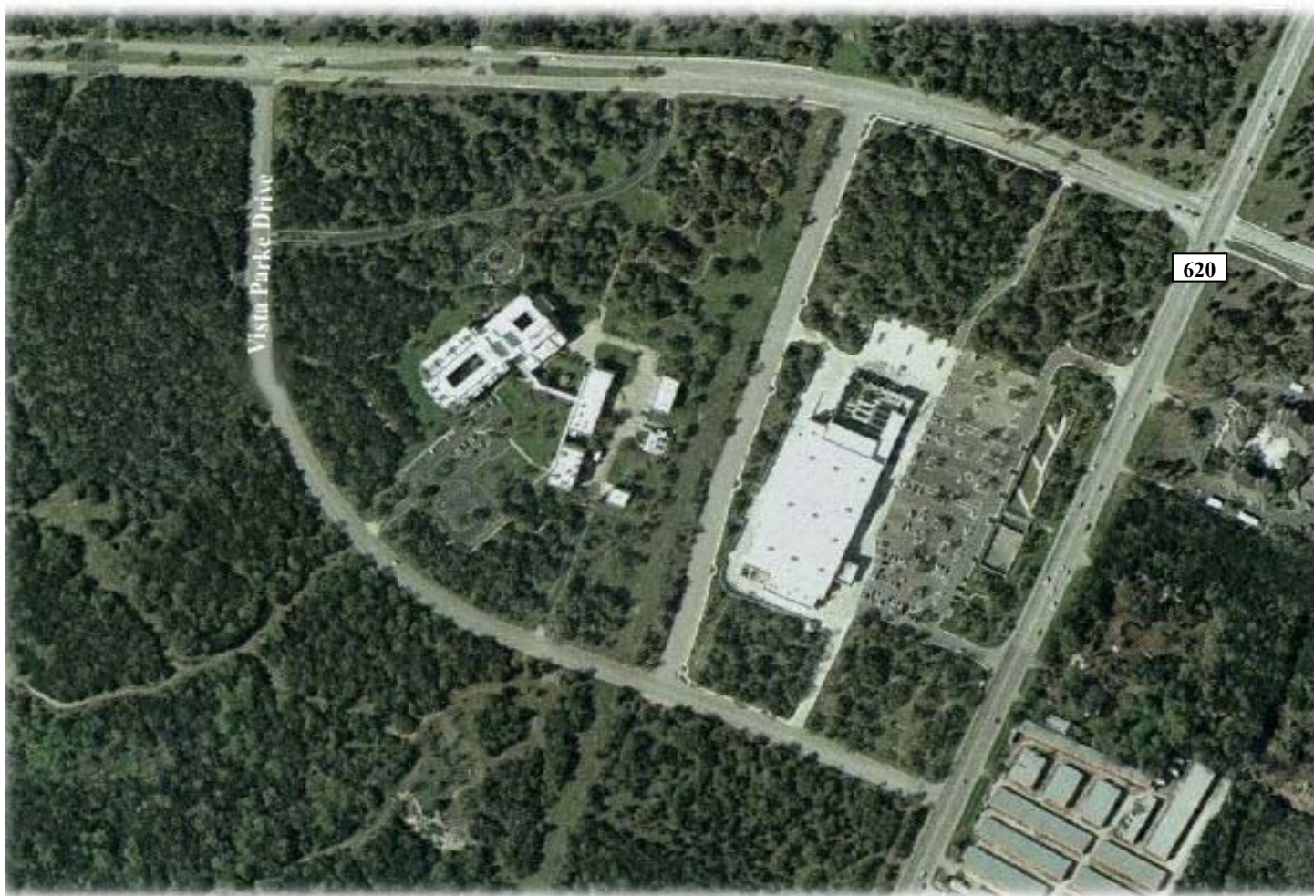
Figure. Map of Leander ISD Proposed Elementary School #19 (Grandview Hills Elementary) [8].